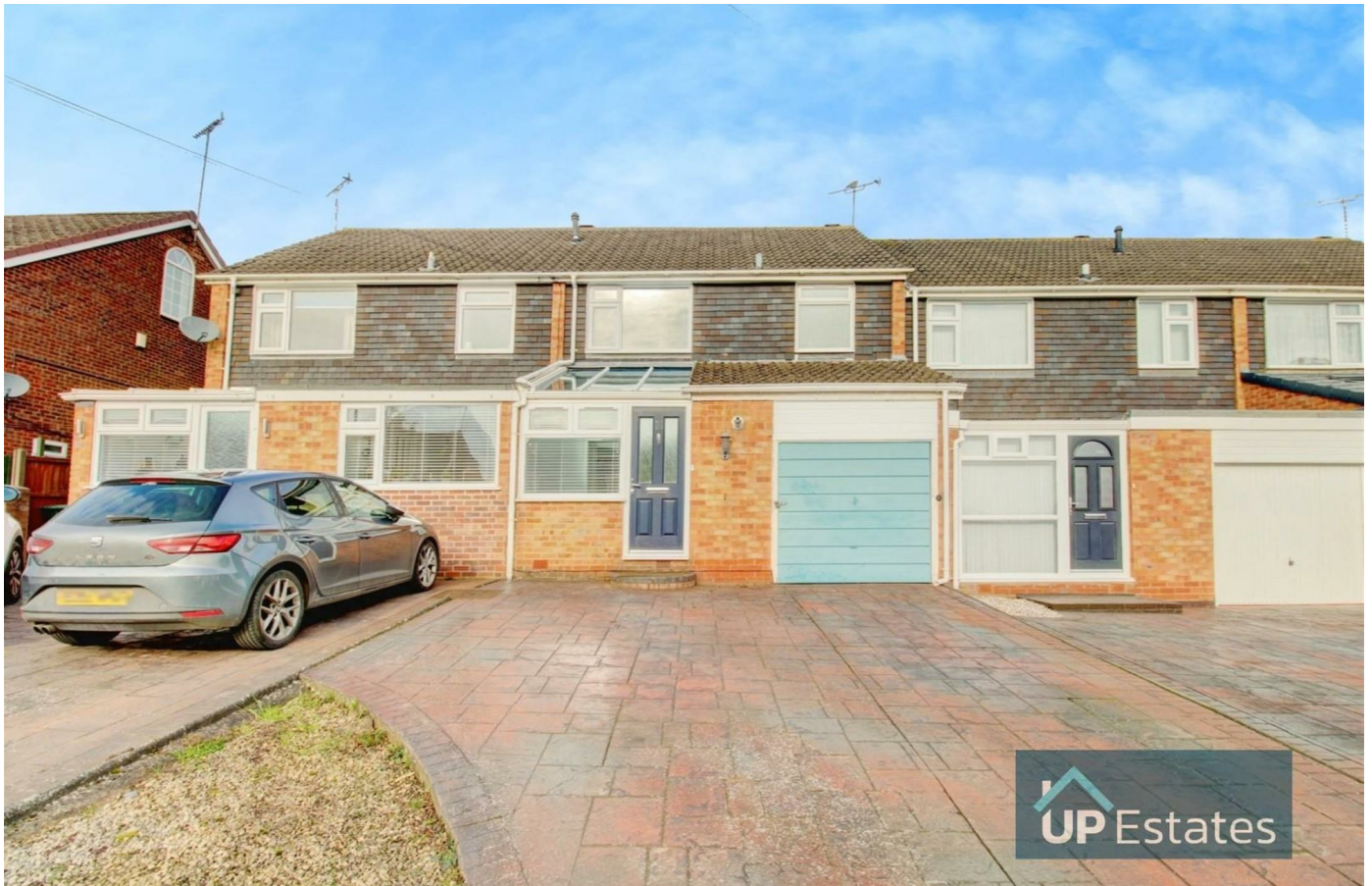
Osbaston Close, Coventry